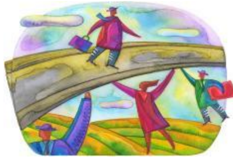
Hope to see you there!

* Space is limited to 30 people so please call or e-mail early to reserve your spot*